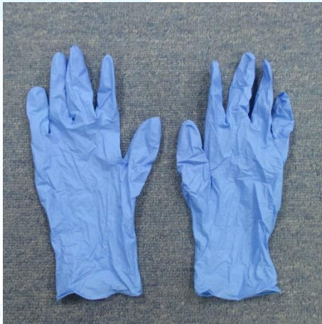
Samples described as Disposable Powder free Nitrile gloves referenced as MDJ01, color: Blue