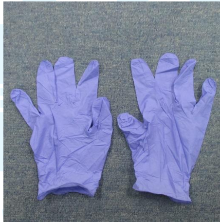
Samples described as Disposable Powder free Nitrile gloves referenced as MDJ01, color: Purple